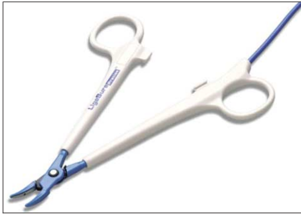
Figure 1. LigaSure Precise diathermy system used in this study (Valleylab, Boulder, Colo).