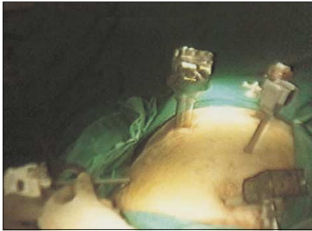
Figure 1. Trocar sites.

abdominal cavity, placed around the cyst, and soaked with 10% povidone iodine solution as a scolecidal agent. The cyst was punctured with a 14-gauge 6F aspiration needle. As a precaution, the tip of a 5-mm suction catheter was placed close to the puncture site (Figure 2), and as much cystic fluid as possible was aspirated, so that the endocyst (germinative membrane) detached from the cystic wall and shrank to the bottom of the cyst. The deflated cystic wall was suspended by 2 graspers, and cystotomy was performed. At this stage, the 11-mm trocar was exchanged for an 18-mm one. A transparent tube with a 15-mm internal diameter was inserted through the 18-mm trocar, and the germinative membrane was aspirated (Figure 3). A hose of the same diameter was connected to the transparent tube, and the entire membrane was removed. In all cases, the telescope was inserted into the cyst to explore for potential biliary openings and retained daughter cysts. The cystic cavity was irrigated with 20% hypertonic saline (another scolecidal agent) several times, and unroofing was performed by partial or near-total cystectomy. Omentoplasty was simultaneously performed in suitable cases. In the remaining patients, a drain was placed in the cystic cavity. Gauzes and pieces of the excised cystic wall were placed in an endosac and removed.