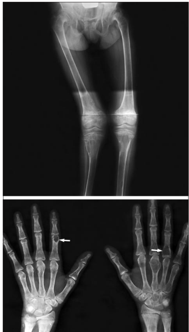
Figure 2. Top, Severe genu valgum. Bottom, Multiple brown tumors (arrows).

iple lytic lesions (brown tumors) were present in her metacarpal bones (Figure 2, top and bottom).