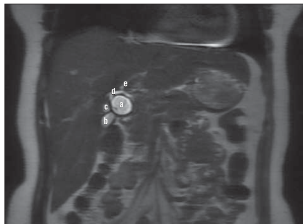
Figure 1. Coronal magnetic resonance cholangiopancreatography view showing the lesion (a) located in proximity to the gallbladder (b), the aberrant right hepatic duct (c), the main right hepatic duct (d), and the left hepatic duct (e).