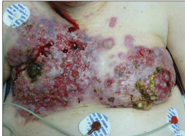
Figure 1. Breast image.