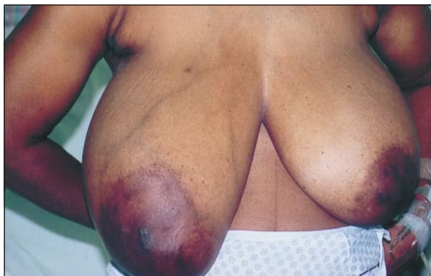
Figure 1. A 15 × 10-cm mass in the patient's right breast grew rapidly during the past 8 to 12 weeks. A “cyst” had been noted previously.

From the Department of Surgery, Grady Memorial Hospital and Emory University School of Medicine, Atlanta, Ga.