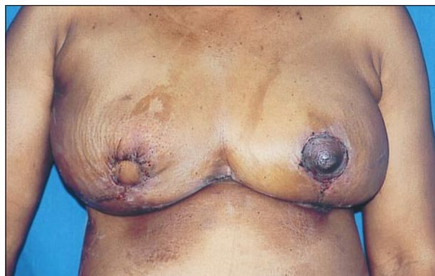
Figure 3. Appearance of patient after right breast reconstruction and left breast reduction.

lodes accounts for approximately 0.5% to 1.0% of all breast tumors. 3,4 The average age of onset is 45 years, but deaths from metastatic sarcoma have been reported in adolescent females. 5,6 A solitary and large unilateral breast mass is the usual sign, and approximately 25% of patients complain of recent rapid growth in a known breast mass. 7