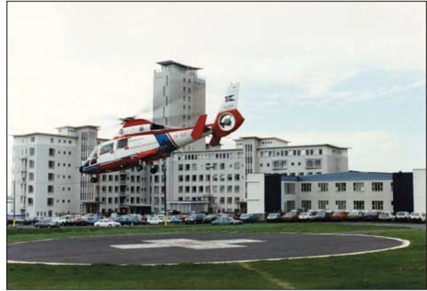
Figure 3. The Reykjavik City Hospital, which among other activities houses the trauma center for Iceland. It opened in 1967.

Through the fishing industry, cheap hydroelectric and geothermal energy, aluminum production, tourism, modern technology, and a health care system available to everybody, Icelanders today enjoy a high standard of living and good health. The perinatal mortality rate is the lowest on record and longevity among the very highest.