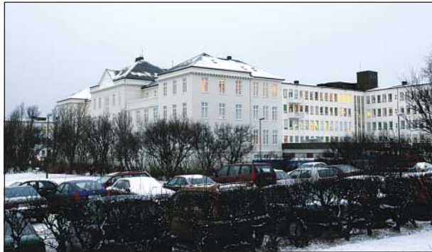
Figure 2. Landspítali, the main teaching hospital since 1930.

Iceland has been an independent republic since 1944. It was settled in the last quarter of the 10th century and the beginning of the 11th century. The settlers came mostly from Norway, although it is thought that they stopped in Ireland and Scotland on their way to Iceland and took some people there as slaves. This has been supported by modern genetic research showing the genetic pool of Icelanders to be a mixture of Nordic and Celtic genes and is also indicated by some local names in Iceland. Icelanders therefore look at their origin as mostly Norwegian but with a blend of Gaelic blood. A republic was founded in Iceland in 930 AD with the governing assembly (called Althing ) at Thingvellir, a place within an hour's drive of Reykjavik and now a beautiful national park. Iceland became Christian in the year 1000 AD. Slavery was not practiced in Iceland after 1100.