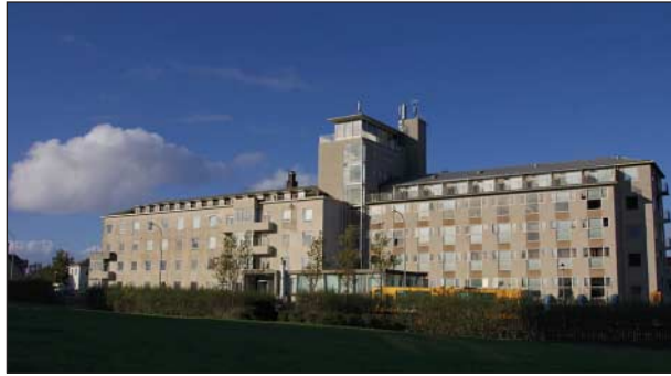
Figure 1. St Joseph's Hospital, the teaching hospital from the founding of the University of Iceland in 1911 until 1930.