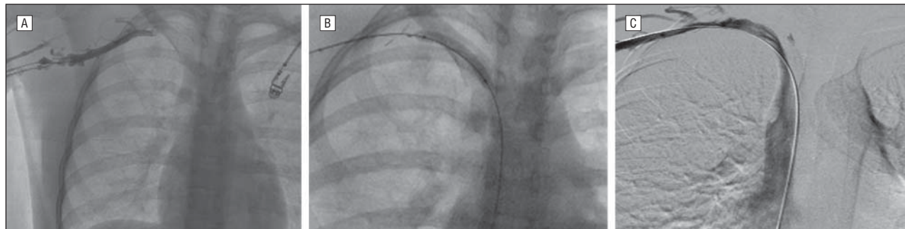
Figure 1. Postoperative venograms in 3 patients with venous thoracic outlet syndrome. A, A patient with subclavian vein stenosis. B, A patient undergoing dilation for a stenotic right subclavian vein. C, A patient with a patent subclavian vein immediately after dilation by means of balloon angioplasty.

eral FRRS, for subclavian vein compression (confirmed by a duplex scan). Venography was performed 2 weeks postoperatively and demonstrated widely patent veins.