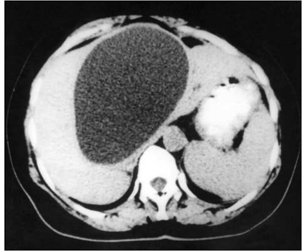
Figure 4. Preoperative computed tomographic image.

Endoscopic sphincterotomy is the first line of treatment for postoperative external biliary fistulas related to treatment of hepatic hydatid disease. 17 In 1 patient, we encountered a biliary leakage through the drain on the second postoperative day, which resolved in 10 days following endoscopic sphincterotomy.