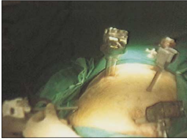
Figure 1. Trocar sites.

abdominal cavity, placed around the cyst, and soaked with 10% povidone iodine solution as a scolecidal agent. The cyst was punctured with a 14-gauge 6F aspiration needle. As a precaution, the tip of a 5-mm suction catheter was placed close to the puncture site (Figure 2), and as much cystic fluid as possible was aspirated, so that the endocyst (germinative membrane) detached from the cystic wall and shrank to the bottom of the cyst. The deflated cystic wall was suspended by 2 graspers, and cystotomy was performed. At this stage, the 11-mm trocar was exchanged for an 18-mm one. A transparent tube with a 15-mm internal diameter was inserted through the 18-mm trocar, and the germinative membrane was aspirated (Figure 3). A hose of the same diameter was connected to the transparent tube, and the entire membrane was removed. In all cases, the telescope was inserted into the cyst to explore for potential biliary openings and retained daughter cysts. The cystic cavity was irrigated with 20% hypertonic saline (another scolecidal agent) several times, and unroofing was performed by partial or near-total cystectomy. Omentoplasty was simultaneously performed in suitable cases. In the remaining patients, a drain was placed in the cystic cavity. Gauzes and pieces of the excised cystic wall were placed in an endosac and removed.