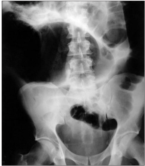
Figure 1. Radiograph demonstrating massive dilation of the colon in a patient who developed Ogilvie syndrome after scapular fracture and repair.

The postoperative state represents a significant risk factor for the development of Ogilvie syndrome. A review of the literature shows that 50% to 60% of acute colonic pseudo-obstructions occur after a surgical procedure or trauma. 4-7 Ogilvie syndrome in the postoperative patient is particularly worrisome, because the patient's abdominal distention may be confused with a simple postoperative ileus. It is important for the surgeon to be aware of the disorder, its risk factors, and its potentially lethal complications, since it may be successfully treated if recognized early. Therefore, the purpose of this study was to identify risk factors in patients who acquired Ogilvie syndrome after operation or injury.