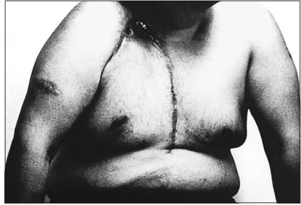
Figure 3. Postoperative photograph of same patient shows myocutaneous flap created after radiation necrosis was seen in clavicular region.

the treatment of primary disease such as lentigo maligna melanoma 18 and for adjuvant control after lymphadenectomy, 19 when the tumor is no longer considered “radio-resistant.” Prospective randomized protocols have confirmed the usefulness of radiation therapy for improving the rates of disease-free survival in patients with melanoma of the head or neck as well as in patients with upper-extremity melanoma. 19-21 The positive effect of radiation therapy has been shown in the palliative management of inoperable and bulky metastatic melanoma. 1,22 Our data support the positive role of radiation therapy when used after surgical excision of involved supraclavicular nodes. Adverse effects of radiation, however, can also be significant. One patient who received 6000 rads to the clavicular region ( Figure 2 ) had paresis of the right arm and radiation necrosis, which required a myocutaneous flap to cover the damaged area ( Figure 3 ).