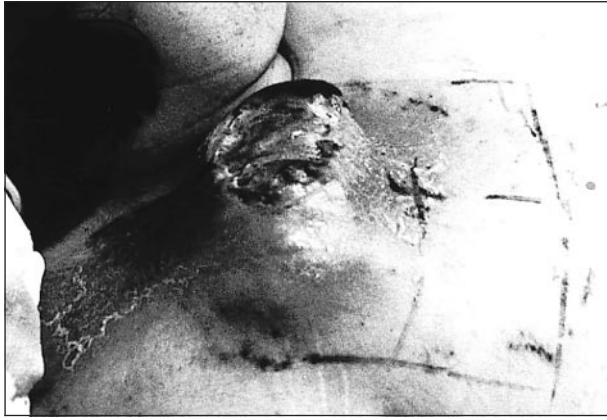
Figure 2. Preoperative photograph shows a patient with periclavicular metastasis.