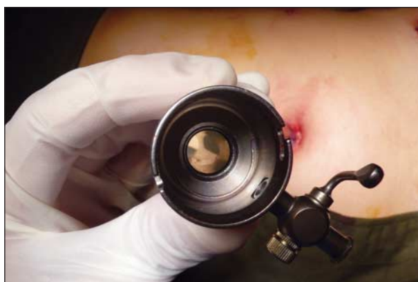
Figure 2. Inside view of the chamber of the HiCap trocar.