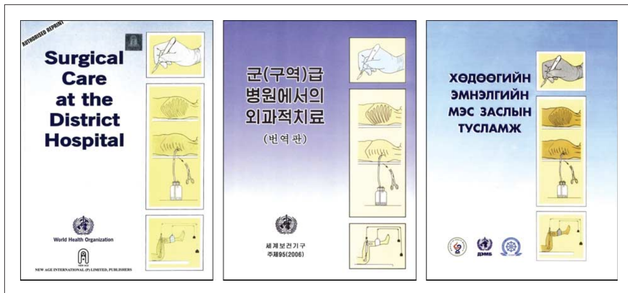
Figure 3. Covers of the English, Korean, and Mongolian translations of the surgical manual included in the World Health Organization Integrated Management for Emergency and Essential Surgical Care tool kit. 4