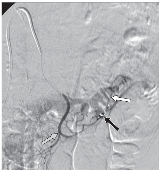
Figure. Superselective Mesenteric Angiography, Which Localizes a Vascular Abnormality in the Small Bowel

A patient with an actively bleeding arteriovenous malformation in the jejunum, despite attempted embolization, underwent SSMA and catheter localization prior to exploration in the operating room. Visceral angiography was performed via a right femoral artery puncture using a 7F sheath and catheter and a 3F coaxial catheter. A contrast agent (Ultravist 300; Bayer) was injected into the inferior mesenteric artery, the superior mesenteric artery, and the fifth and sixth jejunal arteries to delineate the pathology. The patient was found to have arteriosclerotic vessels and no signs of active extravasation. The site of previous embolization in the territory of the sixth jejunal artery can be seen (black arrow), as well as a small vessel bypassing the embolized segment (white arrow) to supply an abnormal-looking area of jejunum containing prominent vascular spaces and early venous drainage. These appearances were consistent with revascularization of the previously embolized arteriovenous malformation. The abnormality was situated at the junction of the territory supplied by the fifth and sixth jejunal arteries. The coaxial catheter was left in the sixth jejunal artery (gray arrow), and the patient was transferred to the operating room for laparotomy and resection following methylene blue injection.